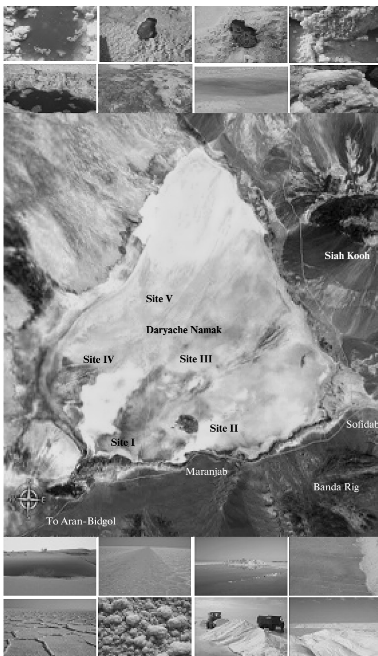
Fig. 1. The map of Aran-Bidgol Lake and the locations of sampling.

Chitinase activity was detected using the modified medium presented by Shaikh et al. [11]. Colloidal chitin (1 g/L) was added to 10% saline nutrient agar. After incubation at 34°C for 7 days, the clear zones around the colonies indicated chitinase activity.